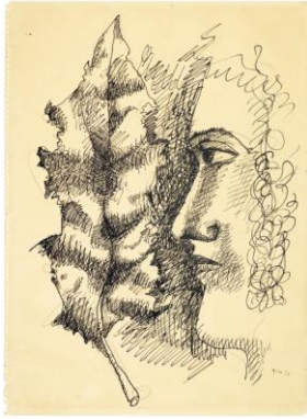
Fernand Léger (1881-1955) Femme à la feuille pen and India ink and pencil on paper Drawn in 1931 Estimate: $18,000-25,000