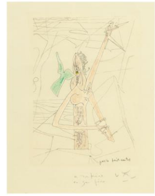
Roberto Matta (1911-2002) Par la bait-naître , from Les Manifestes du surréalisme suivis des prolégomènes à un troisième manifeste du surréalisme drypoint with hand coloring, 1946 $2,000-3,000