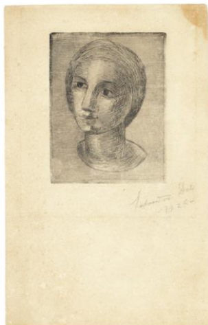
Salvador Dalí (1904-1989) Tête de jeune fille etching, 1924 $30,000-50,000